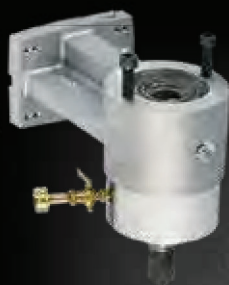
Pillow Block Assembly 1.250\"/>