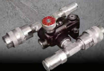
Flow Control Valve Variable speed control that adjusts drilling speeds from zero to the maximum RPM your motor allows. Part # 4250019 (0-20 GPM)