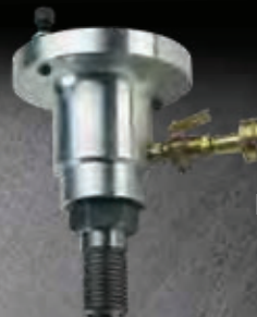
M-4 Pillow Block Assembly For use with M-4 core rigs and Danfoss motor 1.250\"/>