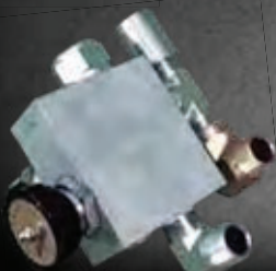
Mounted Flow Control Valve for Char-Lynn Motors Only Variable speed control that adjusts drilling speeds from zero to the maximum RPM your motor allows. Connects directly into motor. For use with hydraulic mounted motors. Part # 4699956 (0-25 GPM)