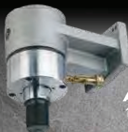
Pillow Block Assembly 1.875\"/>