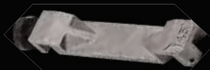
45°/90° Rip Guide For CC900TE tile saws