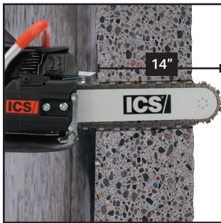
Deep cutting solution for obstructed or small openings