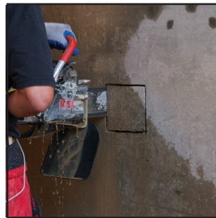
Cut squares as small as 4" x 4" (10 cm x 10 cm)