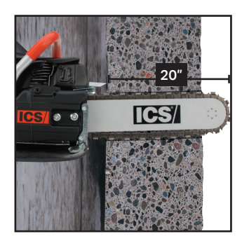
Deep cutting solution for obstructed or small openings